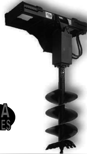
Model Shown: DBA200 with AB12