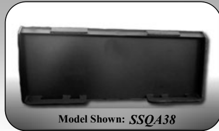
Model Shown: SSQA38