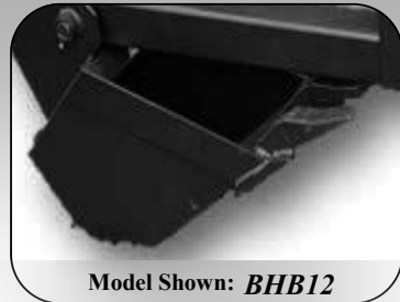
Model Shown: BHB12